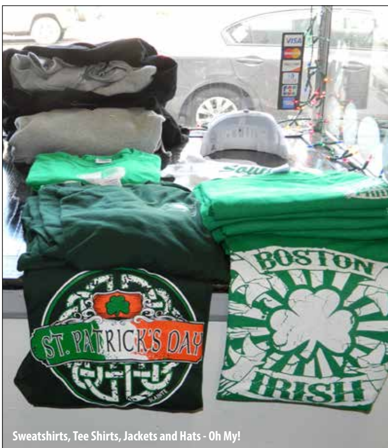
Sweatshirts, Tee Shirts, Jackets and Hats - Oh My!

working pretty much his whole life, starting at a young age. He also credits a hard-working and very competent staff for the success of the business. He stressed that he considers the people who work for him to be much more than employees. To him they are friends and together they make up a great team that have each other's back. We asked him what is it about being a business owner in South Boston that he likes best. He named several things, among them were of course working close to home and the loyalty of so many good customers. One of the things he is so well known for is treating all of his customers with fairness and respect.