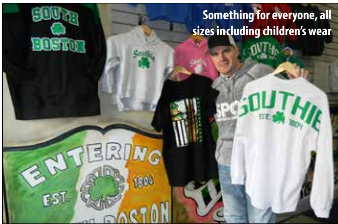
Something for everyone, all sizes including children's wear