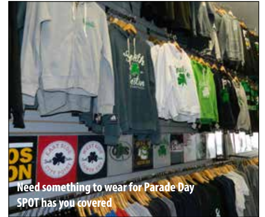
Need something to wear for Parade Day SPOT has you covered