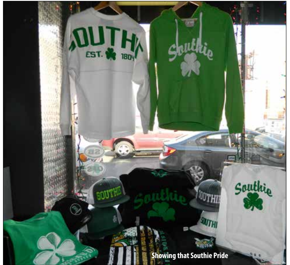
Showing that Southie Pride