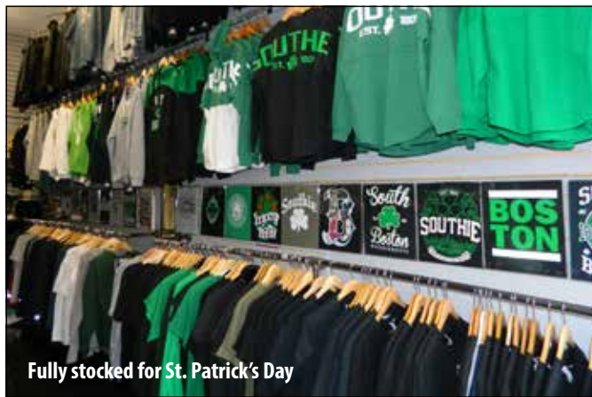
Fully stocked for St. Patrick's Day