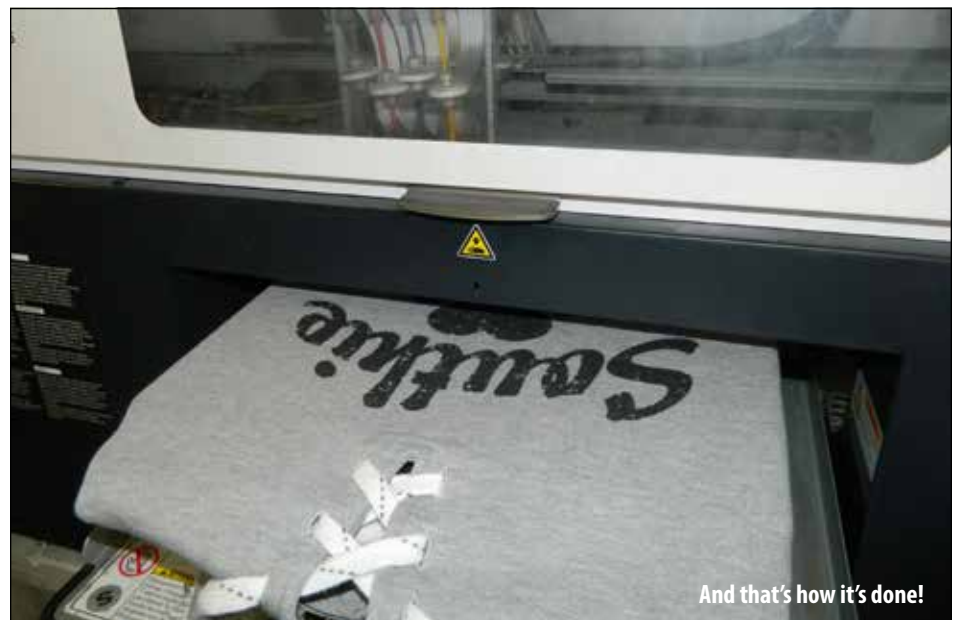
And that's how it's done!