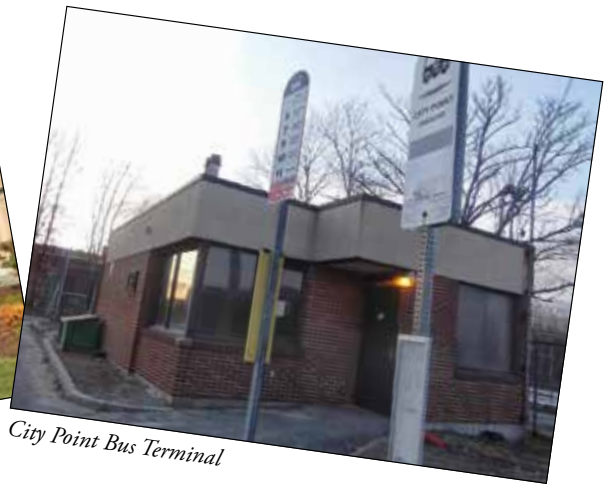
City Point Bus Terminal

Keep cars and trucks out of the South Boston neighborhood – and preserve 7,000 jobs in the Port of Boston. That's our commitment: to be a good neighbor and an economic engine for Massachusetts.