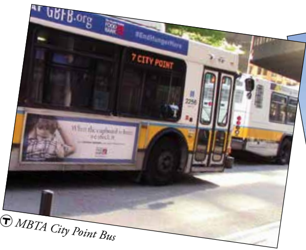
MBTA City Point Bus