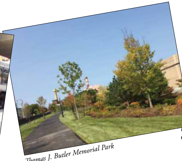
Thomas J. Butler Memorial Park