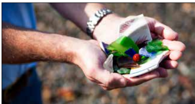
The "Treasures of Spectacle Island" include sea glass, pottery and historic artifacts which help illustrate the story of the transformation of the island from the city dump to the most popular destination in the Boston Harbor Islands State and National Park.