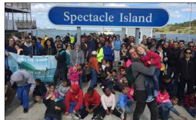
Join Save the Harbor/Save the Bay for a free fall cruise to Spectacle Island on Saturday, September 29th.