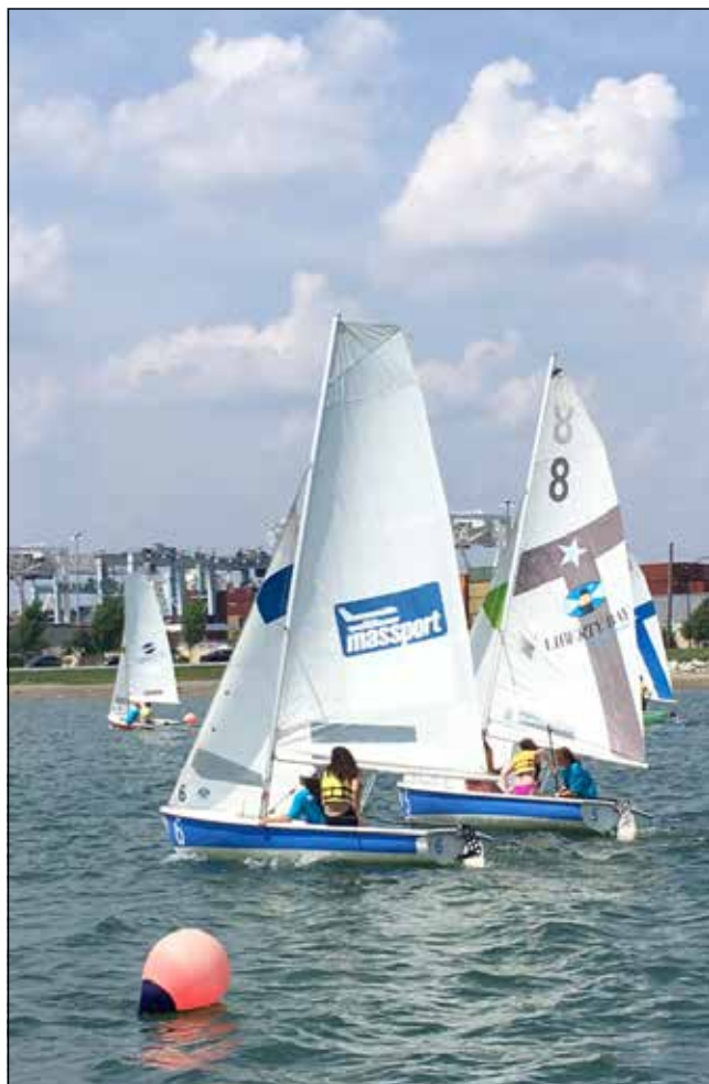
Students working at Harry McDonough Sailing Center