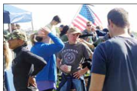
Marine Corp Run continued from page 11

another successful Marine Corps Honor Run and when it was over, it was so much fun that everyone seemed to be looking forward to next year's event. Congratulations to the organizers, the runners, the spectators and everyone else who was involved in any way. And of course, to the United State Marines and all the other military personnel.