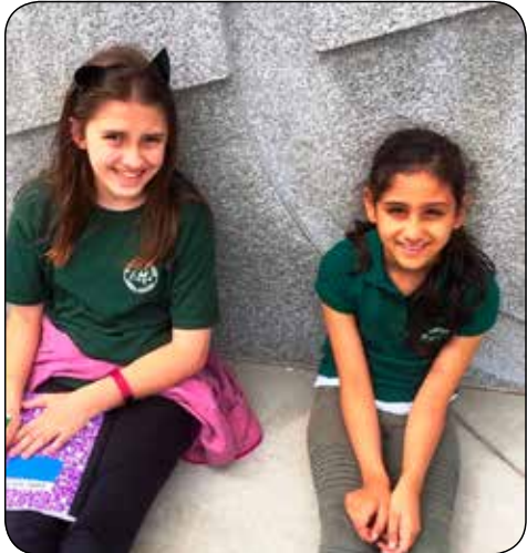
MOM's Club PICS from p. 12