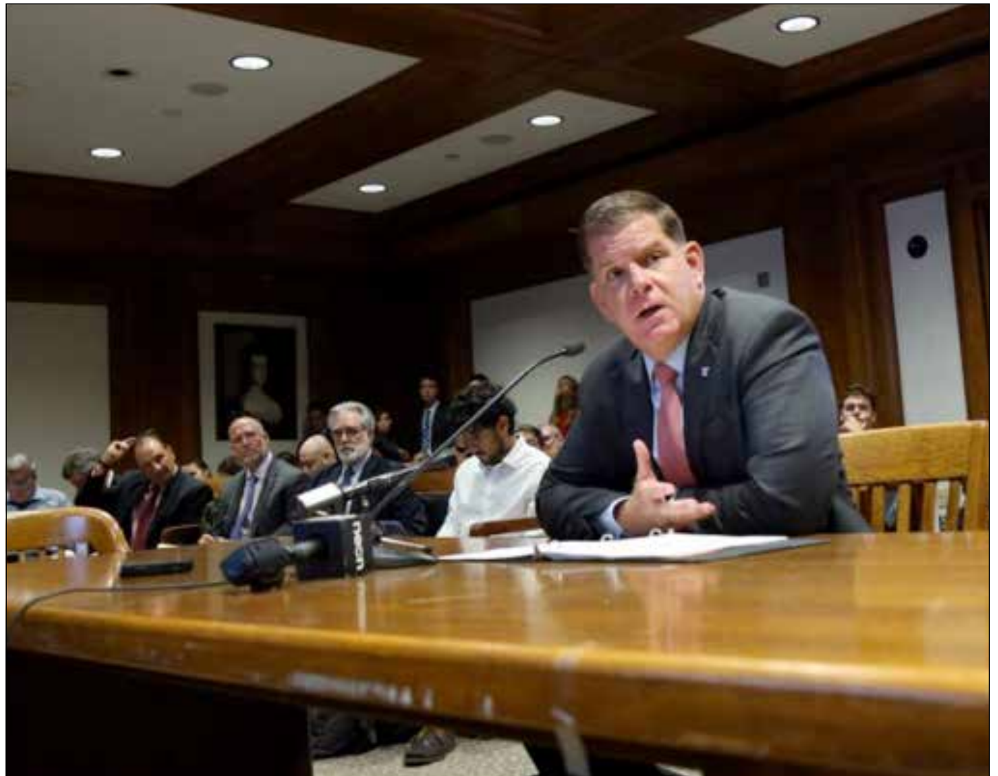
Mayor Walsh testifies in support of "An Act relative to transportation network company rider assessments."

• Incentivizing shared trips: passengers would be charged 6.25 percent of the total fare for single-occupancy trips and 3 percent of the total fare for shared trips. Half of the revenue would go to the city or town in which the miles were driven, and the other half would go to the Commonwealth Transportation Fund