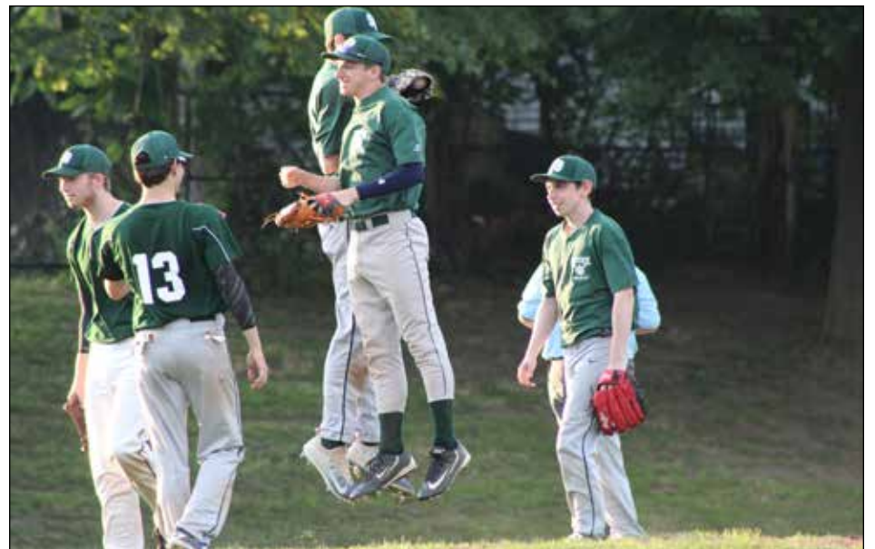
Celebrating the win against Norwood