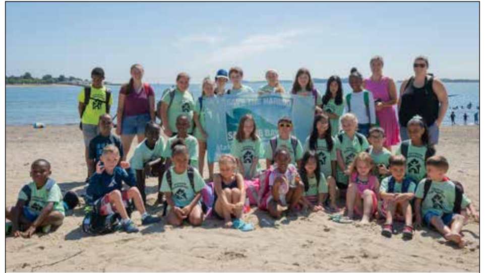
Save the Harbor's Youth Beach Bash and Splash featured traditional beach activities and a cookout, as well as dragon boats and kayaks and a suite of engaging environmental education and cultural enrichment activities, including fishing, crabbing and clamming, Art on the Shore, and Songs and Stories of the sea, led by Save the Harbor's youth environmental education program staff.

Save the Harbor would also like to thank their Program Funders Andus Baker & Rowan Murphy Family Fund, MA Attorney General's Office Healthy Summer and Youths Jobs Program, The Paul and Edith Babson Foundation, Beacon continued on page 14