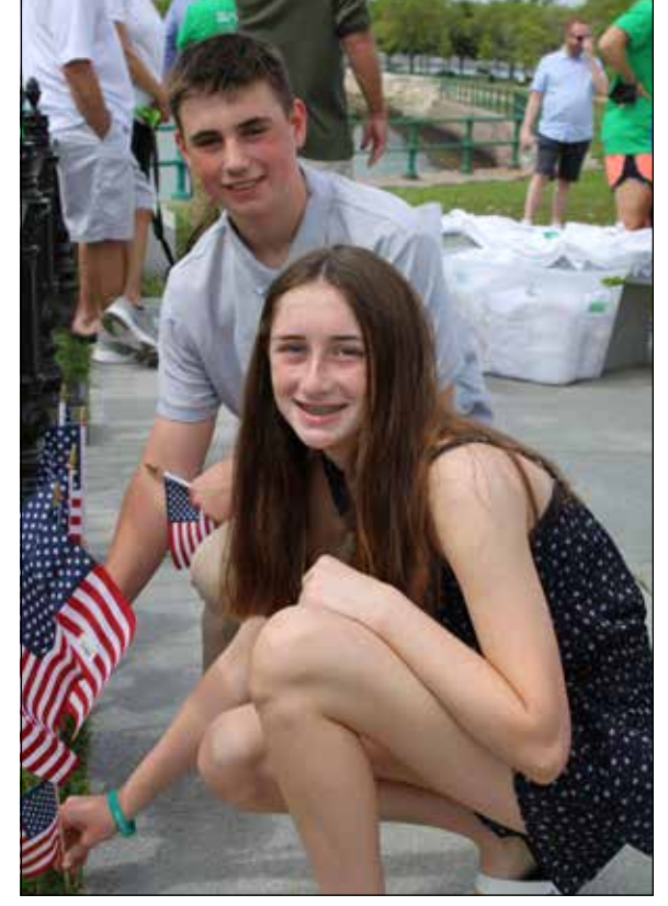
Planting of the Flags at the Korean Memorial