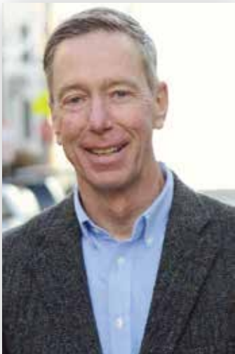
Congressman Stephen F. Lynch

IN REMEMBRANCE OF THOSE WHO GAVE THEIR LIVES IN DEFENSE OF FREEDOM.